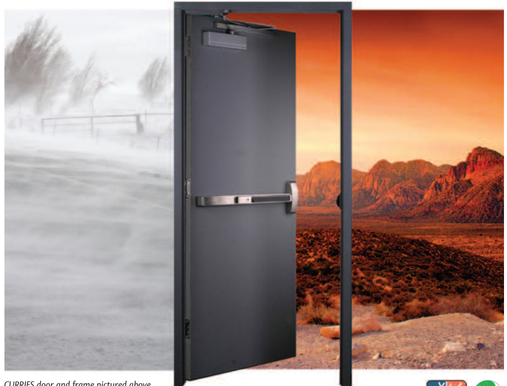
CURRIES door and frame pictured above includes closer and exit device from Sargent and hinges from McKinney.

Doors with Polyurethane core have outstanding thermal properties to provide complete resistance to the harshest winds that mother nature can create.