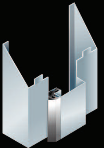
Thermal Break Hollow Metal Frame