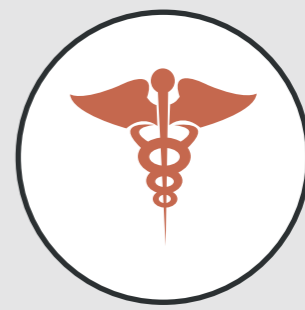
HOSPITALS, E.G., OXYGEN STORAGE AREAS