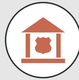
POLICE AND FIRE STATIONS