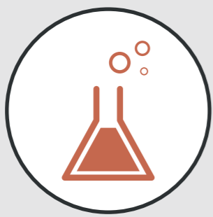
CHEMICAL STORAGE AREAS

HERE'S WHERE "THE FORCE" CAN BE WITH YOU