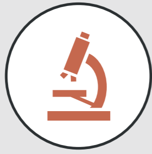
LABORATORIES, RESEARCH AREAS